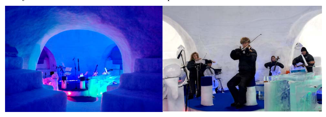
Figure 10. Inside the Ice Dome Concert Hall at Piteå Havsbad 2006.

Six concerts were conducted at an "ice music testival" at Pitea Havsbad during the 16-19 mars 2006. For the opening concert the 16 mars 2006 120 guests were specially invited and a total of 850 persons visited the ice music concerts in 2006. The Ice Dome Concert Hall attracted much interest and the Munich symphony orchestra had announced their interest to give a concert in 2006 but had to cancel in a late stage and Linhart had plans to engage Kraftwerk who also were interested of the concept.