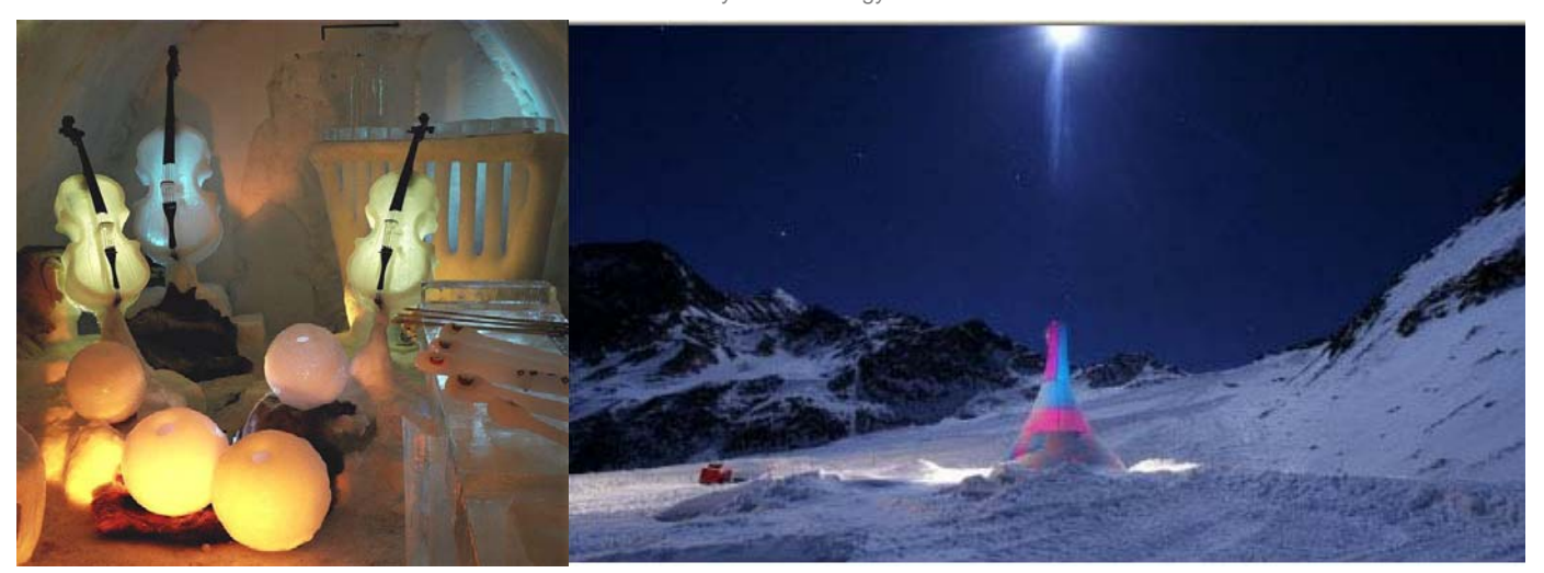
Figure 11. Ice Dome Concert Hall at Schnalstal in 2008.

The concert hall is built with a central domed camber 20 meters high and with side chambers for 160 visitors. 60. Linhart transported with the help of a freezer trucks the ice instruments constructed in 2005 and 2006 from Piteå to Italy. The Ice Dome Concert Hall opened the 18<sup>th</sup> February 2007 and has since then regularly given ice music concerts every Sunday and at special Ice Music Festivals 61. This move by Linhart to Italy left the Piteå ice music project to a halt and uncertain future but there are initiatives by Gelter 62 and others to continue the project.