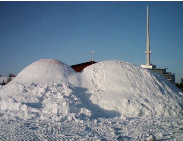
Figure 8. The igloo-baloon and the double-igloo Ice Dome Concert Hall at the School of Music in Piteå.