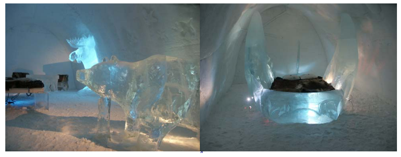
Figure 2. Designed suites in the Icehotel in 2004.

From the original 60 square meters the Icehotel has grown over 80 times and is now the world largest Icehotel with is planed for the season 2008/2009<sup>37</sup> to cosiest of 5500 square meters and build of 21 500 m<sup>3</sup> of snow and 900 tons of ice. In the season 2008/2009 the hotel will have 74 cold rooms. These consists of one Deluxe suite designed by especially chosen artists, 30 specially designed Art suites with special design and sculpture, 13 Ice rooms with furniture's of ice and decorating artwork of ice and 29 snow rooms which are simple but spacious snow rooms with a snowbed.