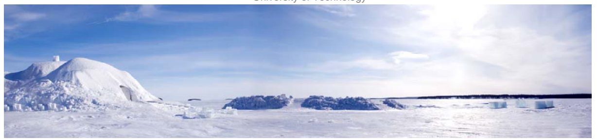
Figure 9 Ice Dome Concert Hall at Piteå Havsbad 2006.

Six concerts were conducted at an "ice music testival" at Pitea Havsbad during the 16-19 mars 2006. For the opening concert the 16 mars 2006 120 guests were specially invited and a total of 850 persons visited the ice music concerts in 2006. The Ice Dome Concert Hall attracted much interest and the Munich symphony orchestra had announced their interest to give a concert in 2006 but had to cancel in a late stage and Linhart had plans to engage Kraftwerk who also were interested of the concept.