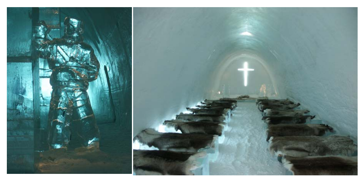
Figure 3. Ice sculpture and the IceChapel at the Icehotel in 2004.

By the beginning of December, the main building is almost finished and the interior work begins. This continues until the end of January. With an indoor temperature of around five below zero, working conditions are relatively comfortable compared to the outdoor temperature, which can drop lower than forty below zero. Working to late in the evening, the sculptors cut and work the ice to create things like interior decorations, windows, doors, pillars, furniture, lamps and naturally - sculptures. About 25 specially invited Swedish and international guest artists from 14 countries come every year to design the décor certain rooms which all have unique design and ice installations. The varied styles of the many artists, together with the properties of the ice, create a unique atmosphere filled with mystique and surprises for the visitors as they wander from room to room.